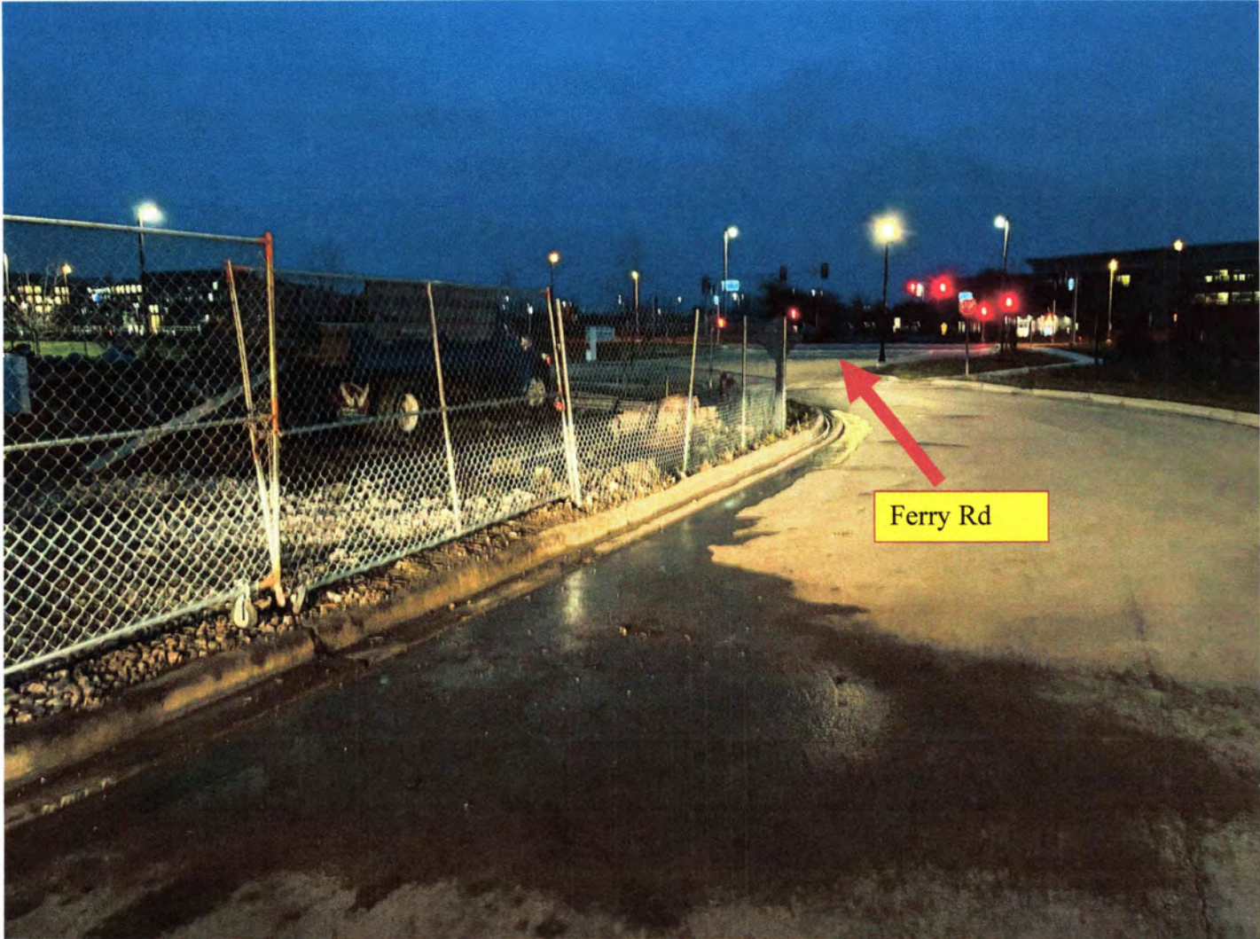
Where truck was viewed with driver in rear. Water is flowing to an inlet