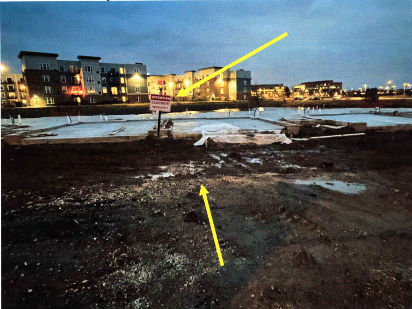
Area concrete was poured with a sign identifying what the toxic material is.....